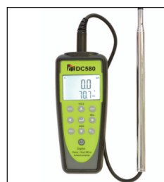
DC580 with hot-wire probe