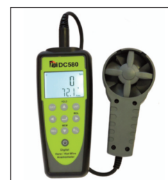
DC580 with vane probe